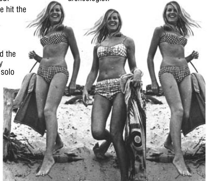
Wild Turkey fan(s)? - Phillip Island racetrack, Jan. 2nd!